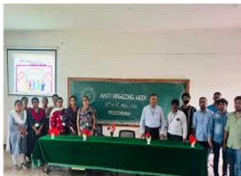
ANTI- RAGGING FELICITATION CEREMONY