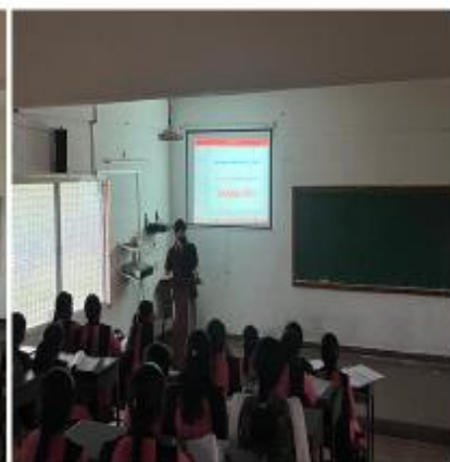
VIDEO SCREENING AND SEMINAR ON ANTI-RAGGING