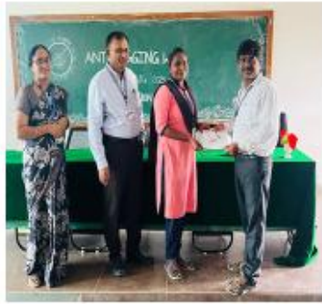
PRIZE DISTRIBUTION CEREMONY