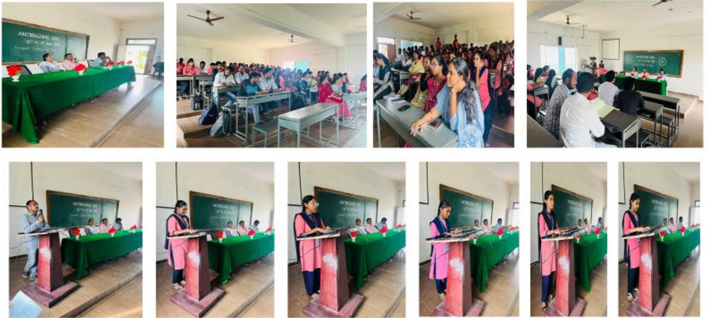
INAUGURAL CEREMONY AND PLEDGE

present in the Programme. By conducting these programs, the students are aware of anti-ragging act and the punishments for involving in the act of ragging. The Programme ended with a determination to keep SKCHS campus ragging free and help, guide and mentor all the students to make them feel safe and secure. This one-week Programme has encouraged the students to promote anti-ragging measures and dare to dream of “ragging free campus.”