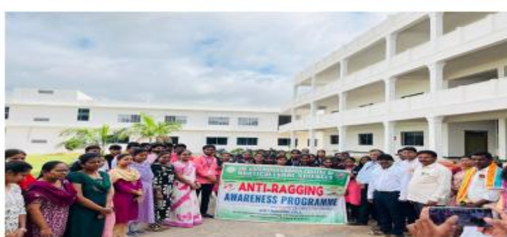
ANTI-RAGGING AWARENESS RALLY