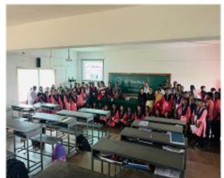
PRIZE DISTRIBUTION CEREMONY